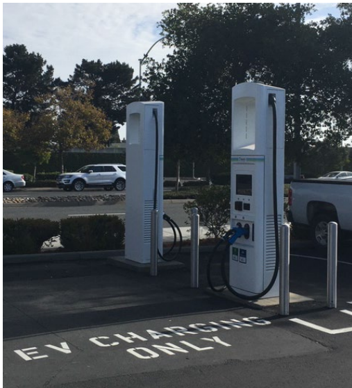
Belmont Safeway - 1100 El Camino Real

For a map of EV charging stations near you, visit PlugShare or ChargePoint .