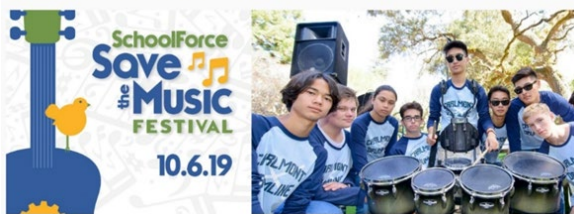
Save the Music Festival

SchoolForce's Save the Music Festival is the largest annual community event in Belmont and raises funds to keep our music programs in Belmont Redwood-Shores Schools by supporting SchoolForce, the Belmont-Redwood Shores Education Foundation.