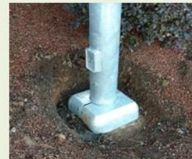
New streetlight pole