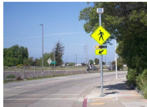
New Rectangular Rapid Flashing Beacon Aids Pedestrians Crossing Shoreway Road