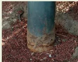
Old streetlight pole