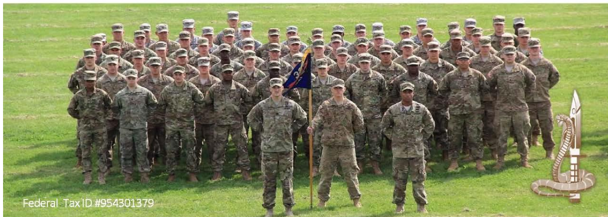
Federal TaxID #954301379

Please make checks payable to: Adopt 101st Belmont